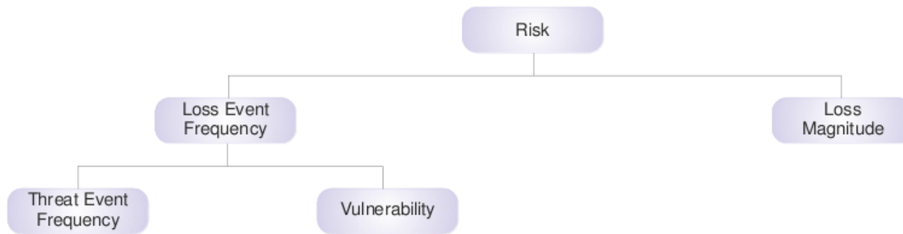
Figure 3: Loss Event Frequency (LEF)

In order for a loss event to occur, a threat agent has to act upon an asset, such that loss results. This leads us to our next two factors: Threat Event Frequency (TEF) and Vulnerability (Vuln).