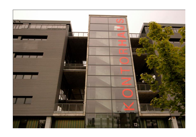
DE-CIX Competence Center @ Kontorhaus Building Frankfurt Osthafen (Docklands)

Phone +49 69 1730 902 - 0 info@de-cix.net